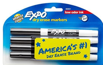
Four thin-tipped dry erase markers