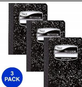
3 sewn-bound composition books