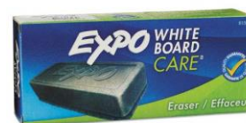
White board eraser or clean sock