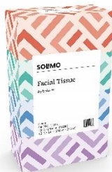
Two boxes of tissues