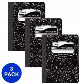
3 sewn-bound composition books

Thank you in advance for weathering yet another back-to-school shopping experience. As parents and teachers, we feel your pain. If anything is unclear, please just send us an email. For convenience, all pictures are linked to Amazon, but feel free to purchase wherever you choose!