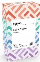
Two boxes of tissues