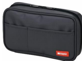
Soft Pencil Case