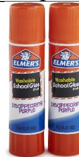
Two glue sticks