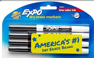
Four thin-tipped dry erase markers