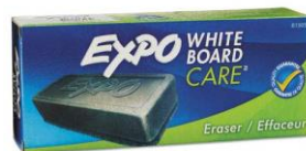
White board eraser or clean sock