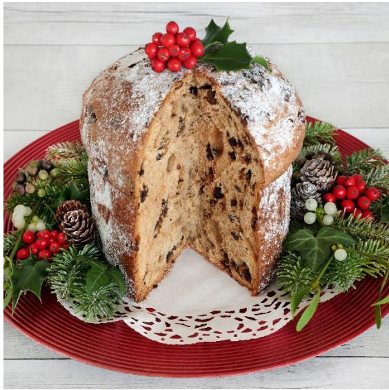
Panettone, Italian Christmas bread

Christmas is a big celebration in Italy! Italians have traditions you won't find anywhere else. Some may eat turkey, but Italians serve seafood as their Christmas meal. The meal is known as the Feast of the Seven Fishes. Fish, clams, or oysters are usually the main course. There are many different sweets for desert. Italy is famous for its sweet bread called panettone . It is tradition for Italian families to enjoy panettone during the holidays.