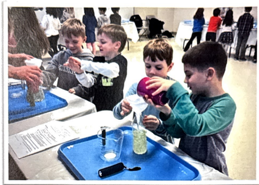
First graders loved making lava lamps during Science Alive!