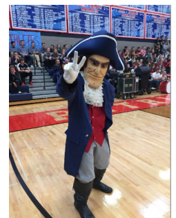
The Patriot mascot poses at the pep rally.