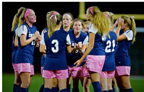
The team gathers in a huddle.