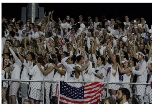
East gets rowdy cheering for the boys.