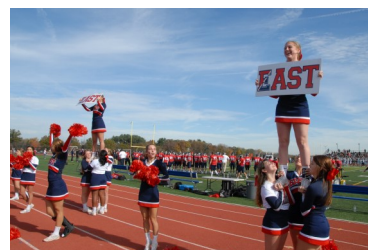
Cheerleaders stunt for the crowd.