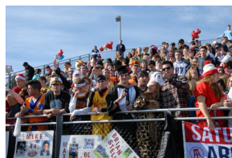
East students wear Halloween costumes as they cheer on our team.