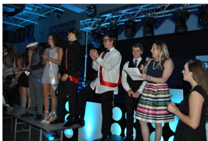
The Homecoming Court at the dance