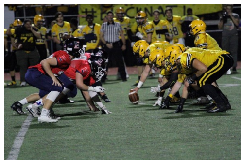
East and West line up before the snap.

CB East pulled off an impressive 23–6 win over CB West on October 21. Touchdowns were scored by Wes Verbit, Chad Guzzie, and Conor Larkin. Wes Verbit secured a game-changing 65 yard touchdown. Barney Amor kicked an epic 50 yard field goal, breaking his own school record.