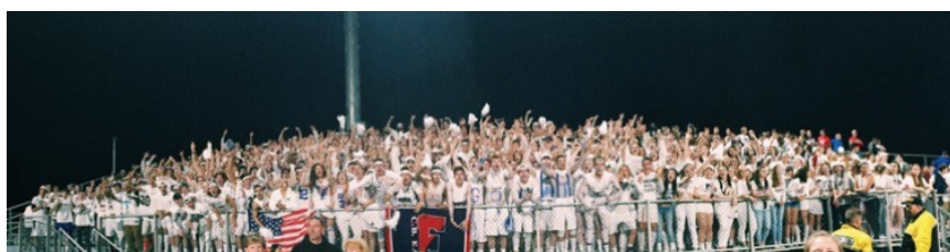
East's spirited student section.

The crowds cheered wildly (East louder than West, of course) throughout the game. Teachers, parents, and students all joined in flashing phone lights, singing “God Bless America,” and other rowdy celebrations. East even celebrated our field goals and touchdowns by creating white clouds of baby powder. This victory over West was one for the books.