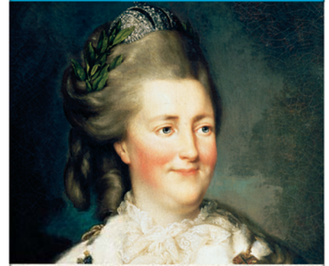
Catherine the Great 1729–1796

By the end of her remarkable reign, Catherine had vastly enlarged the Russian empire. Meanwhile, as Russia was becoming an international power, another great power, Britain, faced a challenge from its North American colonies. Inspired by Enlightenment ideas, colonial leaders decided to do the unthinkable: break away from their ruling country and found an independent republic.