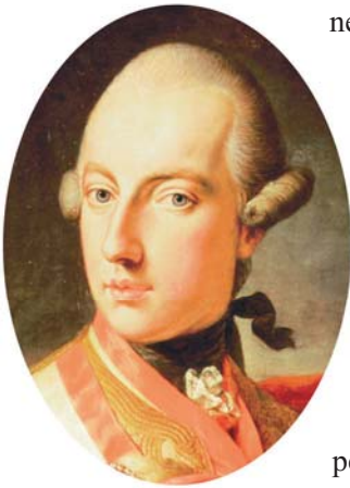
▲ Joseph II

Catherine eventually put in place limited reforms, but she did little to improve the life of the Russian peasants. Her views about enlightened ideas changed after a massive uprising of serfs in 1773. With great brutality, Catherine's army crushed the