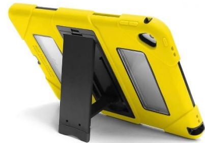
Rugged Protection Case