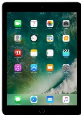
iPad Models: Air 2, 5 th Generation, & 6 th Generation