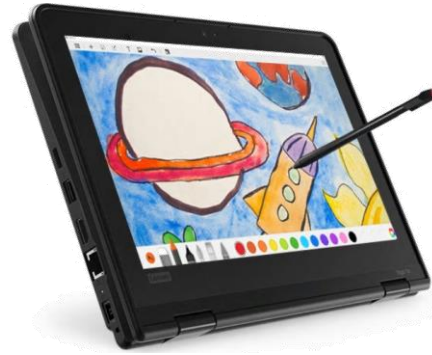
Lenovo Yoga 11e