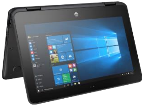
HP ProBook x360

Currently, we have two different models of laptops in circulation.