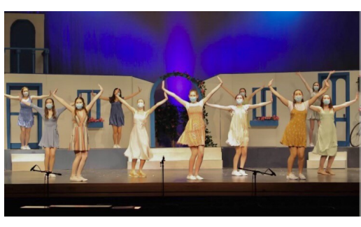
The Dance Ensemble dances to "Mamma Mia" as their big finale.