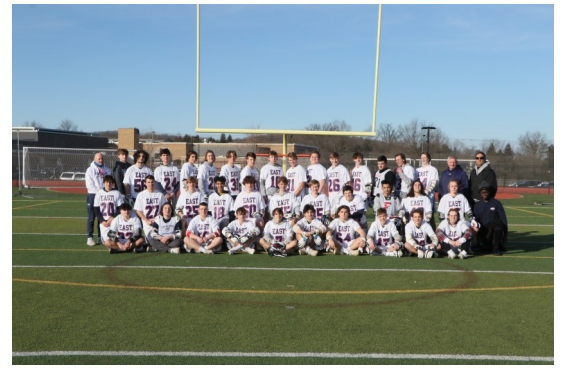
Boys' Varsity Lacrosse team picture.