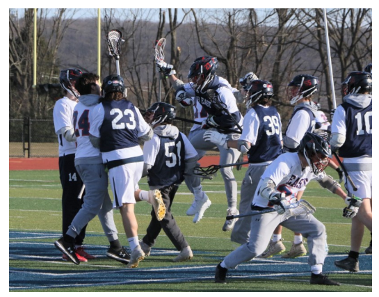
A group of players jumps in the air to get the ball.