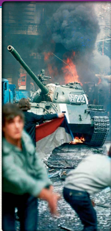
▲ Czech demonstrators fight Soviet tanks in 1968.

In 1989, after Communists lost control of Hungary's government, Nagy was reburied with official honors.