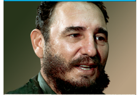
Fidel Castro 1926–

The son of a wealthy Spanish-Cuban farmer, Fidel Castro became involved in politics at the University of Havana. He first tried to overthrow the Cuban dictator, Batista, in 1953. He was imprisoned, but vowed to continue the struggle for independence: