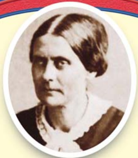
SUSAN B. ANTHONY 1820–1906