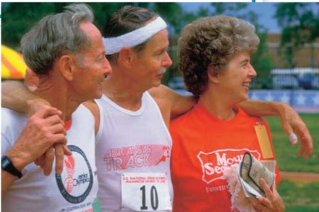
◀ Senior athletes compete at the first U.S. National Senior Olympics held in St. Louis, Missouri, in 2000.

The major programs that provide care for elderly and disabled people are Medicare and Social Security. Medicare, which pays medical expenses for senior citizens, began in 1965, when most Americans had lower life expectancies. By 2000, the costs of this program exceeded $200 billion.