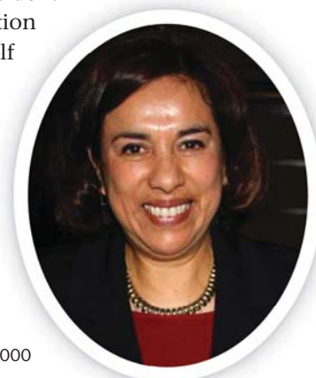
Antonia Hernandez, MALDEF's president 1985–2003

Data from the 2000 census revealed that the Hispanic population had grown by close to 58 percent since 1990, reaching 35.3 million. The 2000 census also confirmed a vast increase in what were once ethnic minorities.