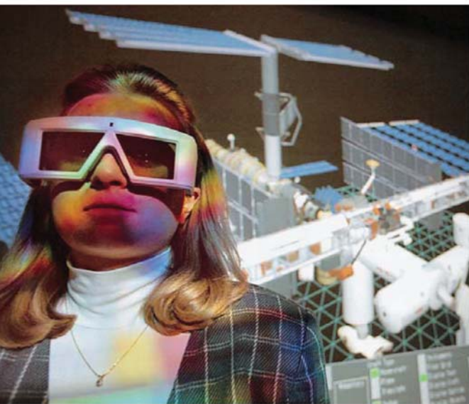
▲ At NASA Langley Research Center in Virginia, an aerospace engineer wearing stereo glasses sees a 3-D view of a space station simulation, as shown in the background.

The exciting growth in the telecommunications industry in the 1990s was matched by insights that revolutionized robotics, space exploration, and medicine. The world witnessed marvels that for many of the “baby boom generation,” people born in the late 1940s and the 1950s, echoed science fiction.