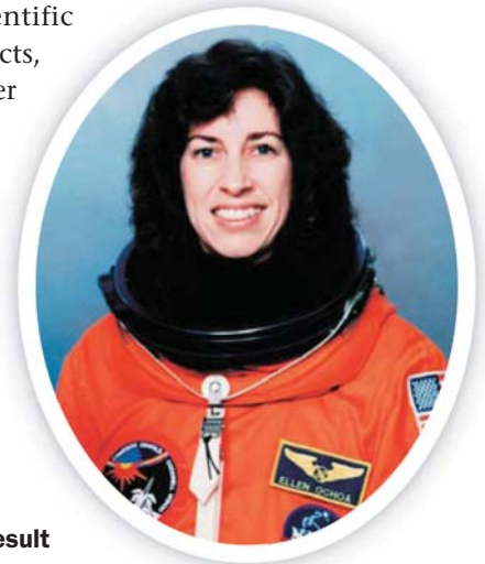
Dr. Ellen Ochoa

BIOTECHNOLOGY The most profound insight into the book of life came from the field of biotechnology. The Human Genome Project, an international effort to map the genes of the human body, and Celera, a private company in molecular biology, simultaneously announced in 2000 that they had sequenced nearly all of the human genome only a decade after the research began. Cooperation via the Internet and access to computerized databases by multiple research groups vastly accelerated the scientists' ability to identify and order over three billion chemical