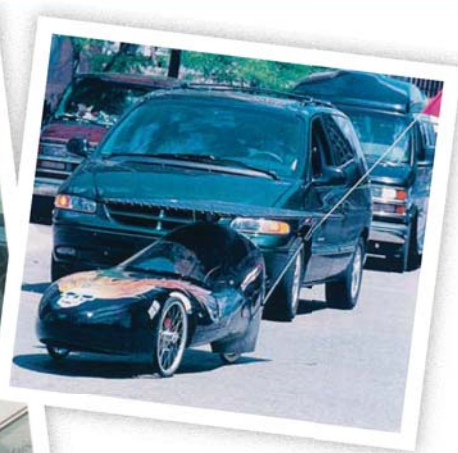
▲ A solar-powered car built by high school students from Saginaw, Michigan, makes its way through busy traffic.

ENVIRONMENTAL MEASURES With the spreading use of technology came greater concern about the impact of human activities on the natural environment. Scientists have continued examining ways to reduce American dependence on pollution-producing fossil fuels. Fossil fuels such as oil provided 85 percent of the energy in the United States in the 1990s but also contributed to poor air quality, acid rain, and global warming. Many individuals have tried to help by reducing consumption of raw materials. By the early 1990s, residents set out glass bottles and jars, plastic bottles, newspapers, phone books, cardboard, and aluminum cans for recycling at curbsides, and consumers purchased new products synthesized from recycled materials.