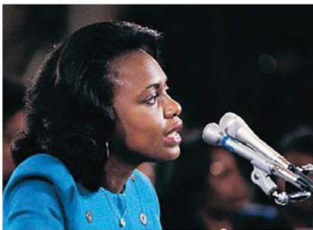
Anita Hill and Clarence Thomas testify before the Senate Judiciary Committee in October 1991.