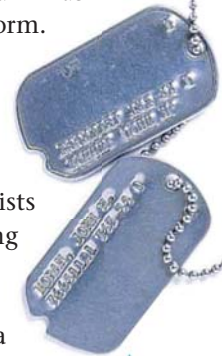
▲ First used in World War I, dog tags were stamped with personal identification information and worn by U.S. military personnel.

By 1967, Americans were evenly split over supporting and opposing the war. However, a small force outside of mainstream America, mainly from the ranks of the nation's youth, already had begun actively protesting the war. Their voices would grow louder and capture the attention of the entire nation.