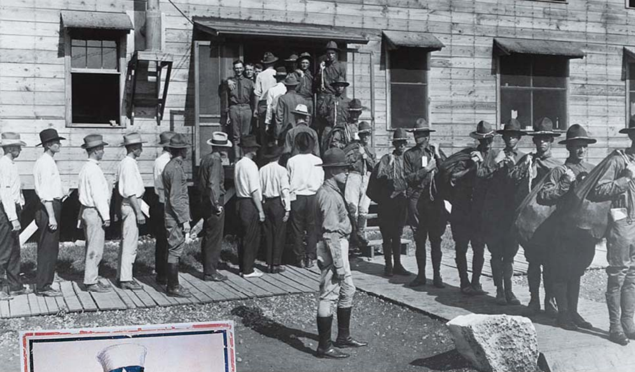
◀ Drafted men line up for service at Camp Travis in San Antonio, Texas, around 1917.