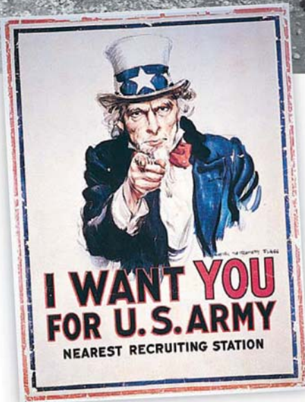
▲ James Montgomery Flagg's portrayal of Uncle Sam became the most famous recruiting poster in American history.

RAISING AN ARMY To meet the government's need for more fighting power, Congress passed the Selective Service Act in May 1917. The act required men to register with the government in order to be randomly selected for military service. By the end of 1918, 24 million men had registered under the act. Of this number, almost 3 million were called up. About 2 million troops reached Europe before the truce was signed, and three-fourths of them saw actual combat. Most of the inductees had not attended high school, and about one in five was foreign-born.