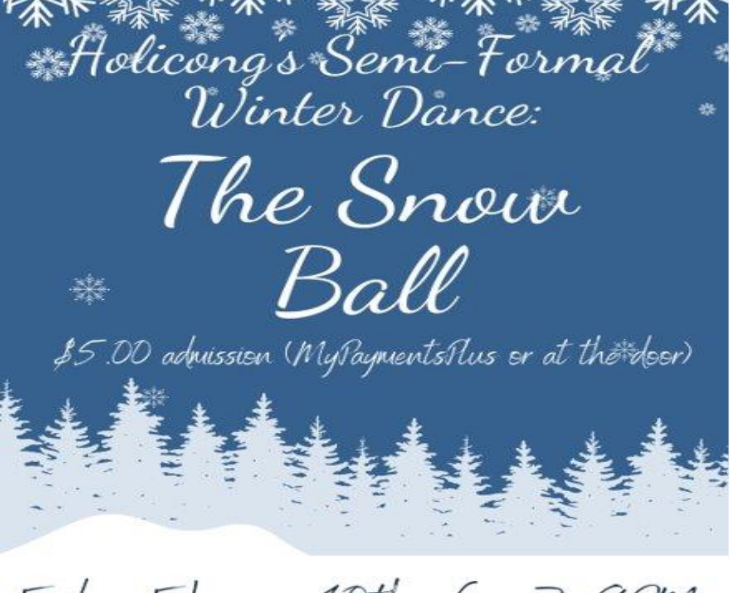
Friday. February 10th from 7-9PM. Snacks provided.

What? Semi-Formal Dance Who? All Holicong Students Where? Here at Holicong When? Friday, Feb. 10th How much? $5.00 Admission