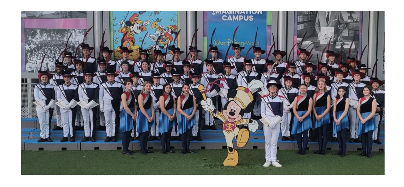
C B East Marching Band with Participating 9<sup>th</sup> Grade Holicong Students at Disney World!