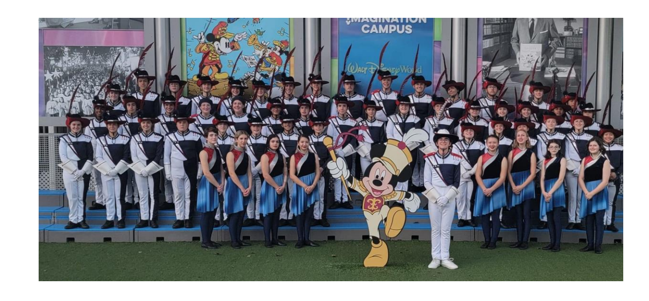
C B East Marching Band with Participating 9<sup>th</sup> Grade Holicong Students at Disney World!