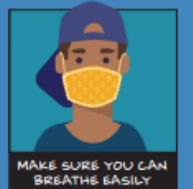
PLACE OVER NOSE AND MOUTH